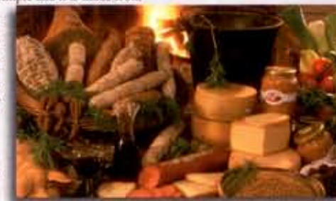
"...the delicious taste of Umbrian dishes..."

We've thought a lot about children: there are two mini swimming-pools just for them, and a play area where they can enjoy themselves under their parents watchful gaze. There are even mini toilets near the pool. At Il Collaccio kids run wild in the fresh air, make new friends and discover new things: first of all the pleasure of living in the countryside. An experience they'll thank you for and will never ever forget.