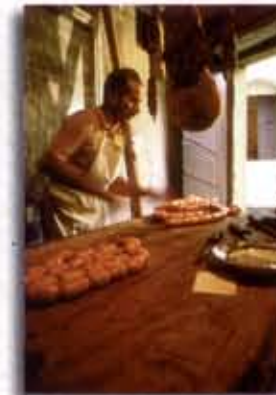
"...the cultural identity of the area..."

room with kitchen, toilet with shower, telephone line, television, and a nice space for eating outside in the garden. Just a few metres under it the new swimming pools with a magnificent view on the Valcastoriana and the village of Preci.