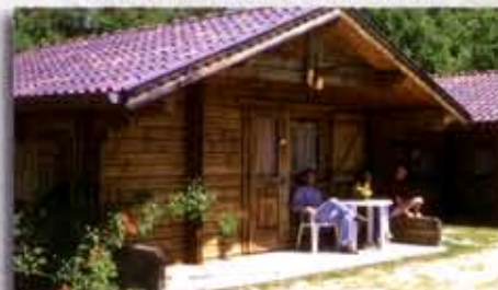
"...the chalets are very comfortable wooden houses..."