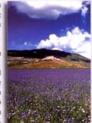
"...in the Monti Sibillini National Park..."

There are artistic and natural treasures that few people knows such as the Abbey of St. Eutizio and the untouched medieval villages in Valcastoriana. Il Collaccio is more the keen on preserving the cultural identity of the area. This is why we invest in rediscovering of traditional Umbrian cooking. This is why we have at the Easter and Nex Year a "Pink week" (a course in the art of making hams and salamis) which unites culture and good food.