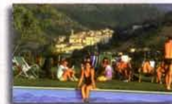
"...the swimming pool over delightful countryside..."

For two centuries it was the farmer's house, today the Locanda del Porcellino has kept all his original charm and is even covered by the shadows of the same large oak trees. The rooms many of which have terraces, are different one from the other and are furnished with original Thirties beds and armchairs. You can also find two rooms