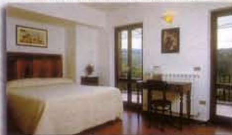
"...the rooms are complete with original thirties furniture..."

For young people and outdoor fans: the campsite.