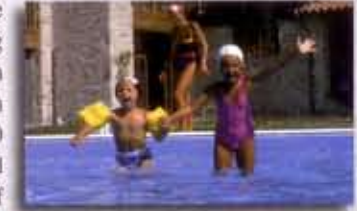
"...children's needs are specially catered for..."

Naturally, if you must, you can take some strenuous exercise. At Il Collaccio the restless will find lots of things to do. Aside the splendid country walks on the Monti Sibillini, Il Collaccio has a small foot-ball pitch, a volley-ball court, bowls, mountain-bikes, an excellent tennis court and two nice swimming-pools overlooking delightful countryside. You can even take up hang-gliding and paragliding. The rivers Nera and Corno are perfect for canoeing and rafting. You can free-climbing in Ferentillo at only 40 Kilometres away and the nearby village of Ussita has one of the