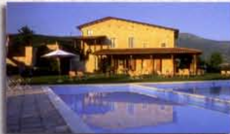
"...il Casale Grande, the massive stone clubhouse..."

Collaccio has become the perfect base for nature fans. Today offers hospitality for every different taste, at very different costs.